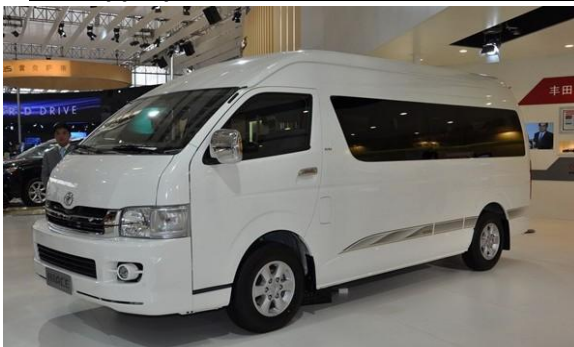
Above: Joylong Van Exterior (Similar)