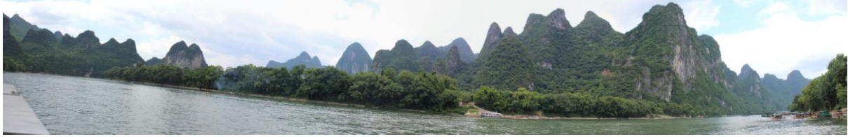
Li River Panoramic