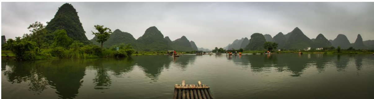
Yulong River Rafting