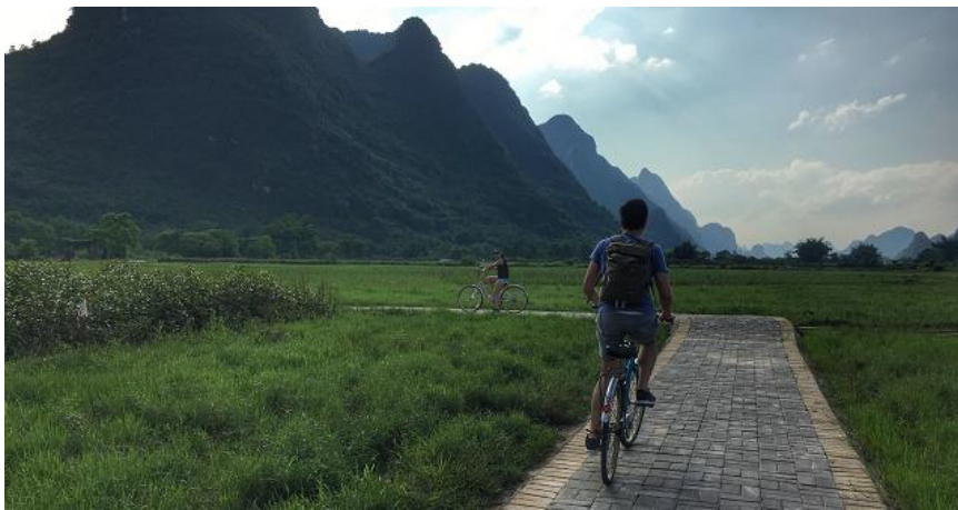
Yulong Valley Countryside Cycling