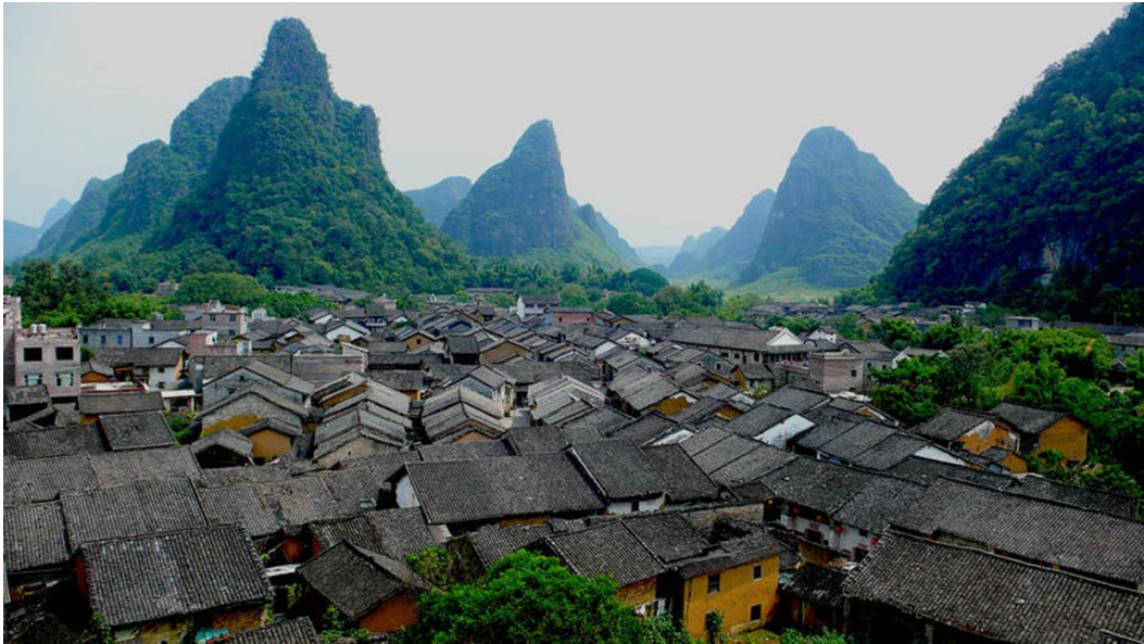
Huangyao Ancient Town