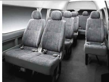
Above: Joylong Van Interior (similar)