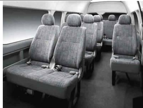
Above: Joylong Van Interior (similar)