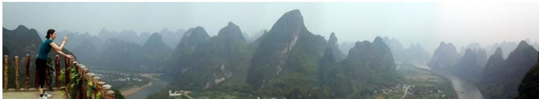
View from Xianggong Hill