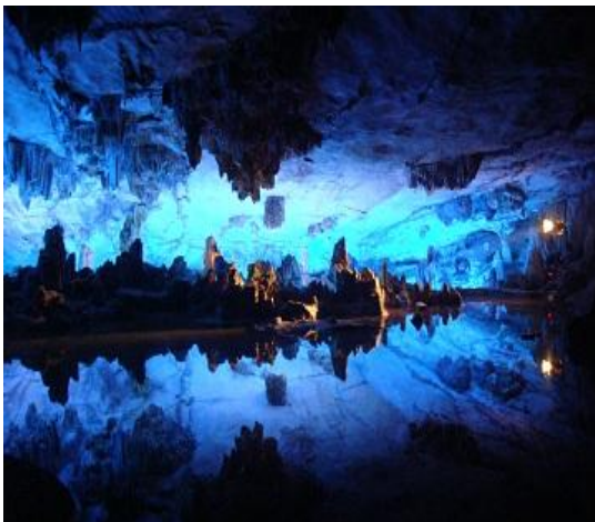
Reed Flute Cave