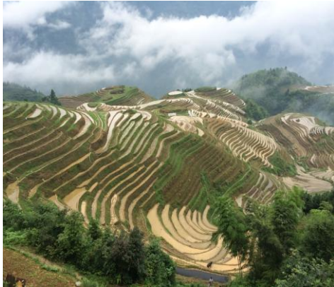
Longji Rice Terraces