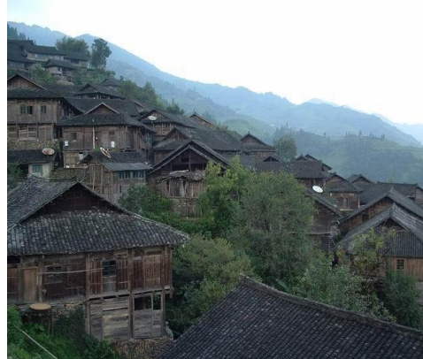
Longji Zhuang Village