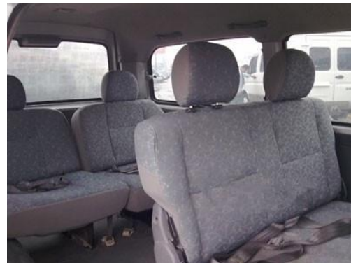
Above: Superior Van Interior (similar)