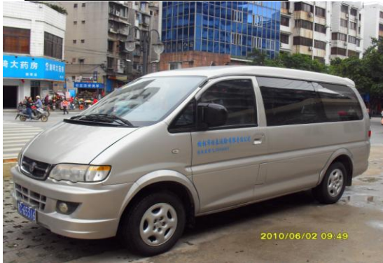
Above: Superior Van Exterior