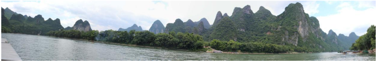
Li River Panoramic